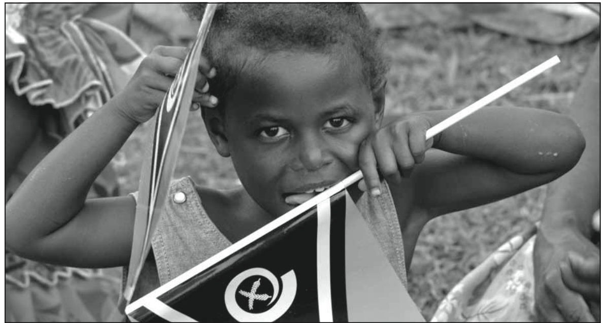
Vanuatu's independence day. Photo: Graham Crumb/Imagicity.com (CC BY-SA 3.0)

To begin with the largest country, PNG. A country with very ancient human presence, going back tens of thousands of years, PNG was divided between the German and British empires from 1884. Australia took over colonial control from 1914 to 1975. This “contribution” has ensured that PNG remained extremely poor, with almost half of the population living at subsistence levels.