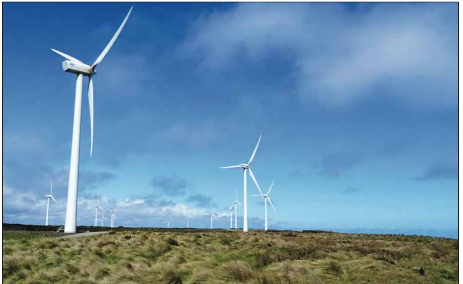
Cape Grim Tasmania.

Privatisation of power generation began under the Kennett Coalition government in Victoria in the early 1990s. Privately-owned, for-profit generators add a layer of profits to costs for consumers. Energy is an essential service which has been commodified with private profit, not people's needs the primary driving force in its generation, distribution and sale.