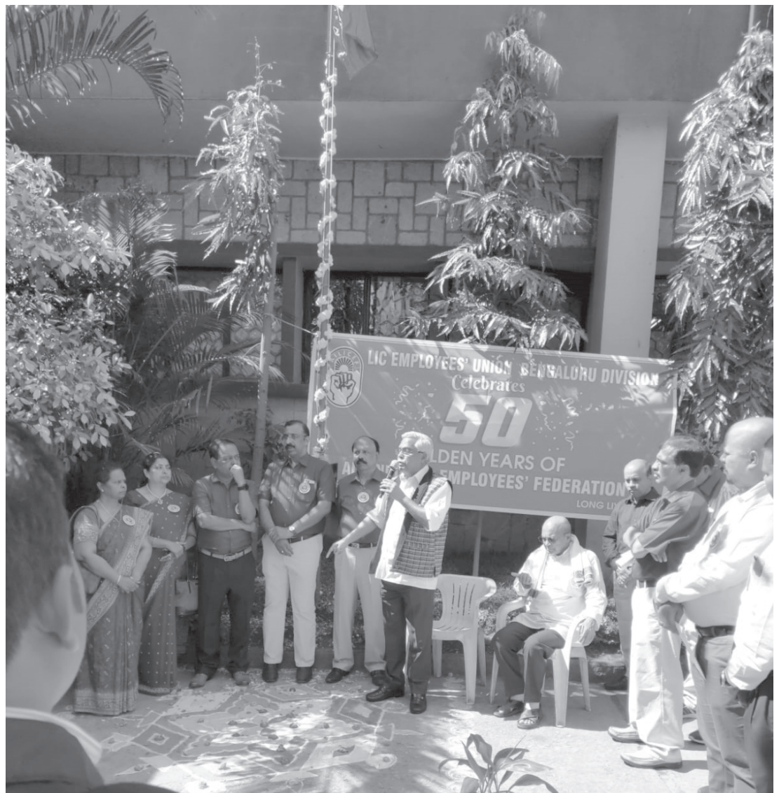
Binoy Viswam MP, president of AILICEF, addressing the participants

He complimented the LIC for its fantastic contribution to our country's growth and the duty of everyone of us is to safeguard and protect this great institution. There is a need for all the employees in the Financial Sector to come on a single platform to diffuse and defeat the moves of the central government, whose role has now become to eliminate the public sector and entertain private sector in every field, he added. He