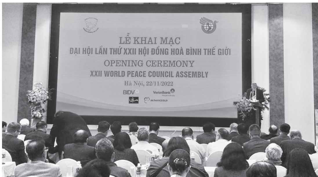
Vice Chairman of the National Assembly, Tran Thanh Man, addressing WPC Assembly

The 22 nd Assembly of the World Peace Council opened in Hanoi on November 22, 2022 focusing on global development and challenges facing peace, security, and stability.