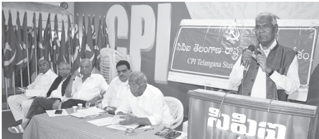
CPI general secretary D. Raja addressing Telangana state council meeting