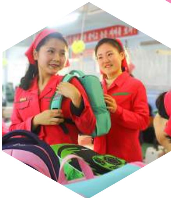
At the Pyongyang Bag Factory.

Working people across the country produce essential goods for students with sincerity