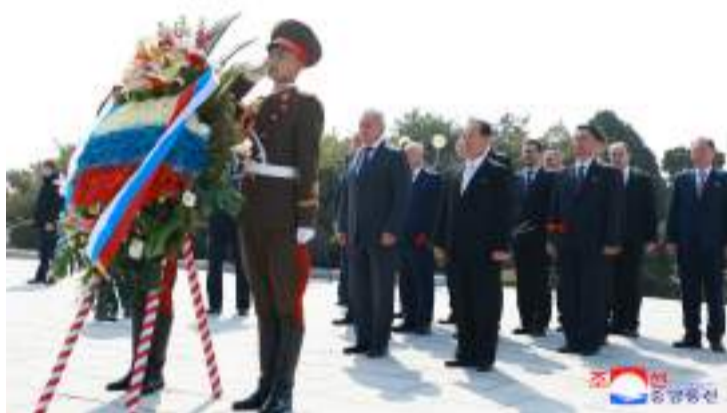
The delegation of the Security Council of the Russian Federation led by Secretary Sergei Shoigu lays a wreath at the Liberation Tower in Pyongyang on March 21.