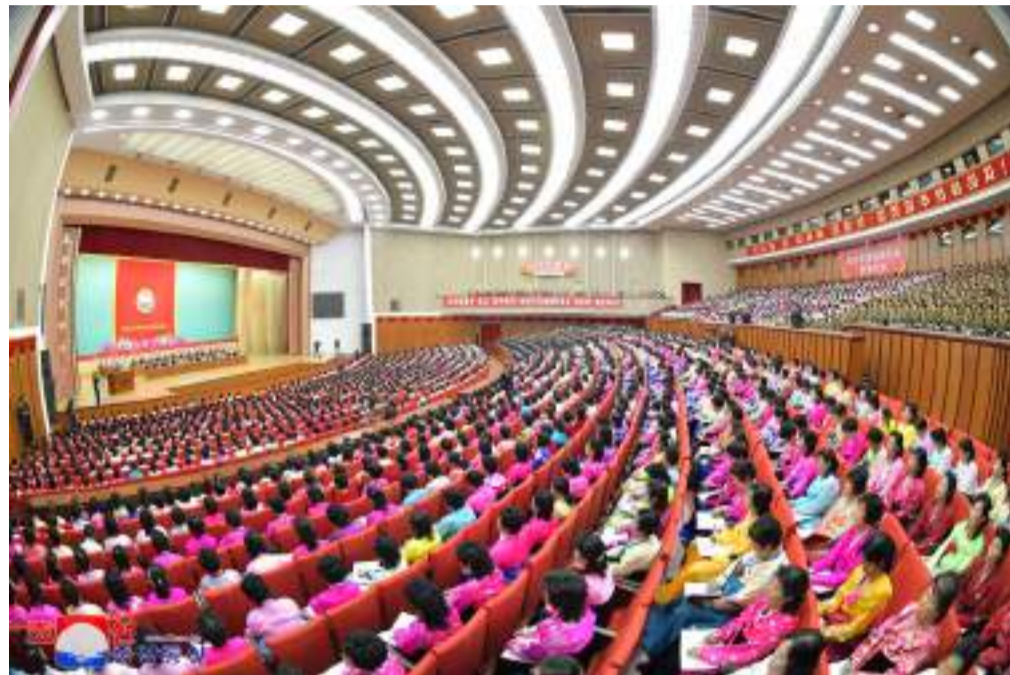
The third national meeting of active neighbourhood unit leaders is held in Pyongyang on March 16-17.