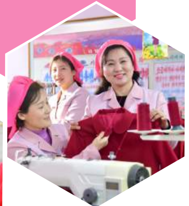
At the Pyongyang School Uniform Factory.