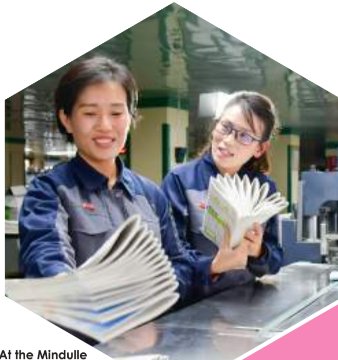
At the Mindulle Notebook Factory.

The happy laughter of children and their song "We Are the Happiest in the World" are resounding far and wide on this land as the most beautiful and wonderful hymn to the great Kim Jong Un's era and the motherly Party.