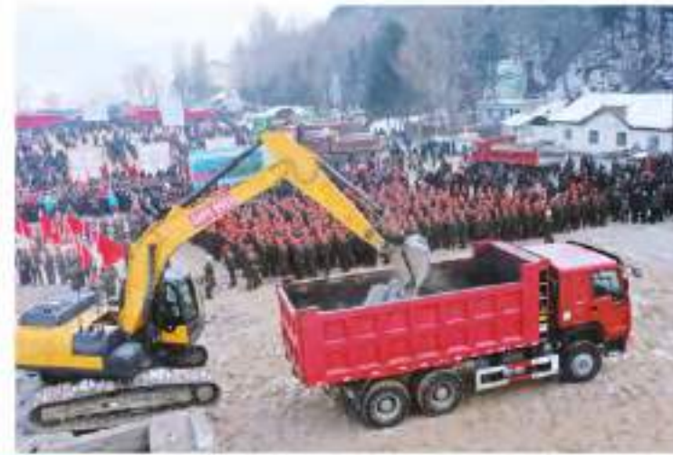
regional-industry factories in Kim Jong suk county