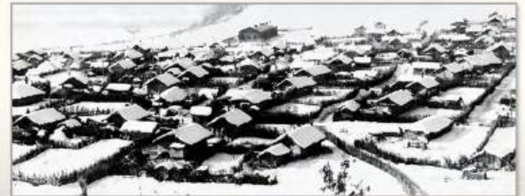
Mutiaotun, Xiaoshahe in Antu County, where Commander Kim Il Sung founded the Anti-Japanese People's Guerrilla Army