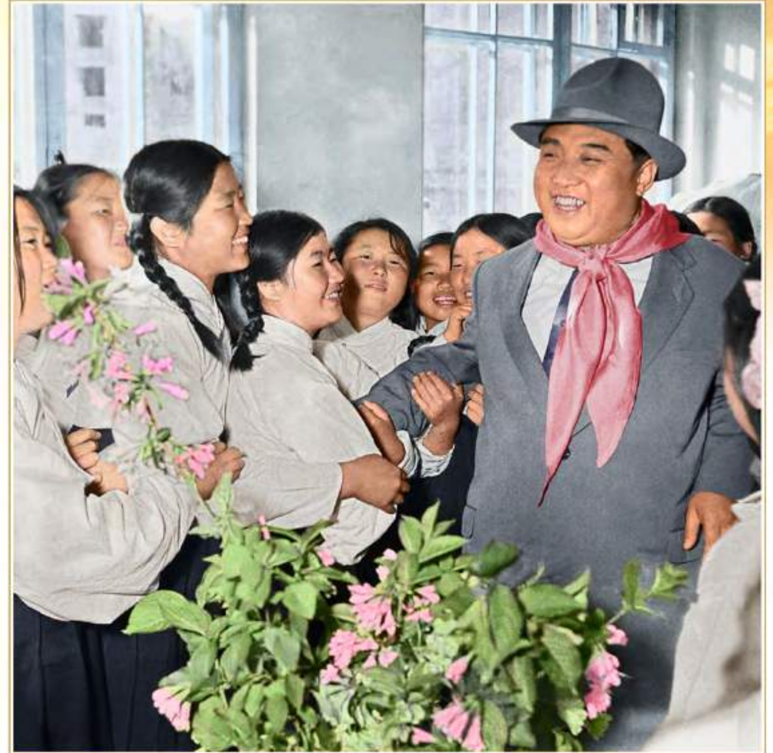
President Kim il sung together with the children of revolutionary martyrs in may 1961