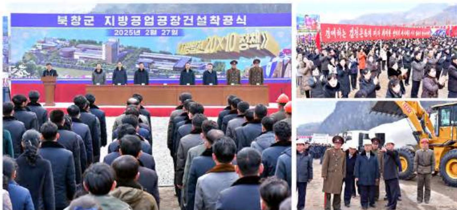
regional-industry factories in Pukchang county