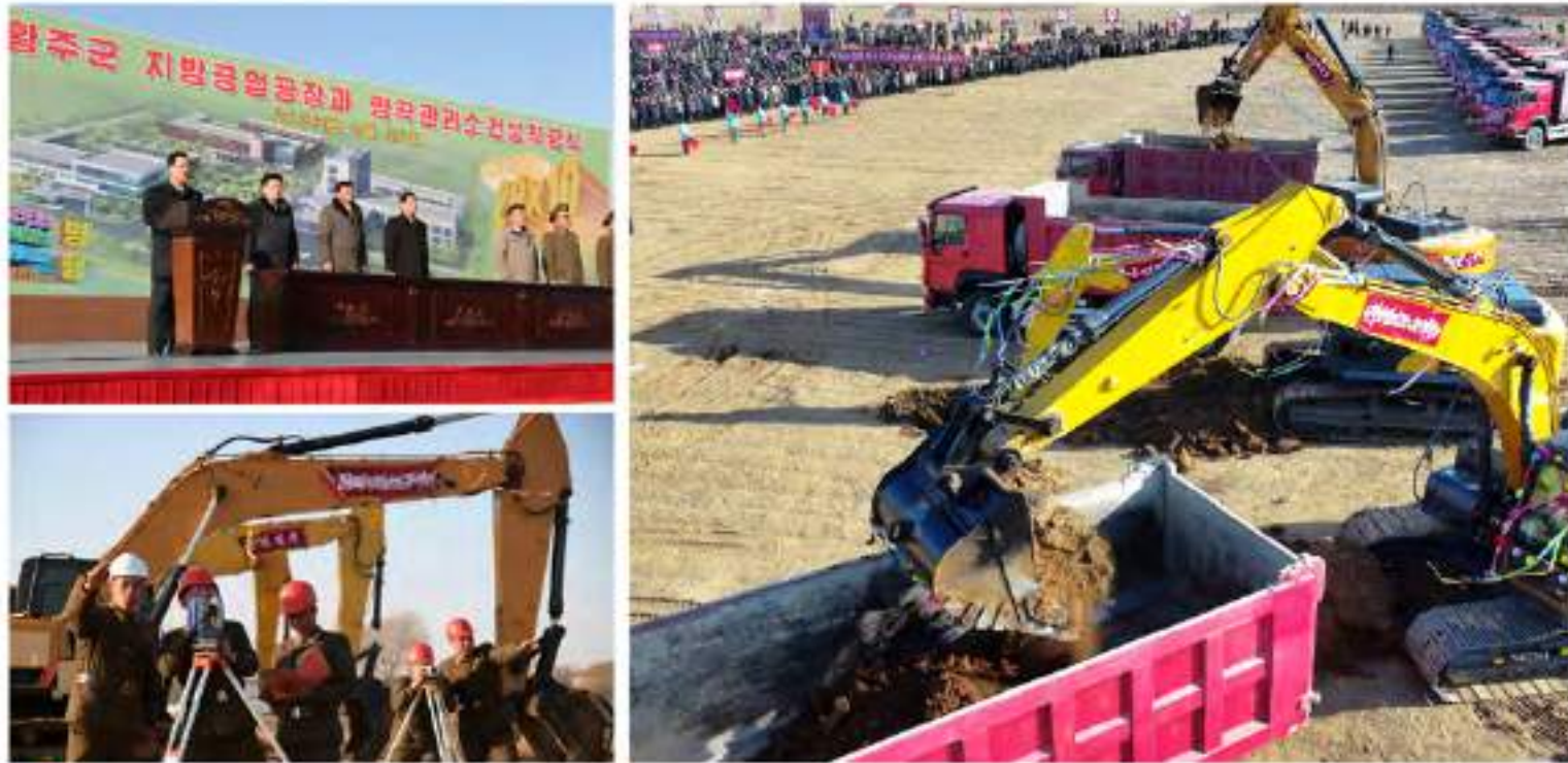
Regional-industry factories and grain storage station in Hwangju County

Groundbreaking ceremonies of regional-industry factories and grain storage station in Hwangju County, regional-industry factories in Pukchang, Yomju, Paechon, Janggang, Cholwon, Kilju, Kangdong, Jangyon, Puryong and Kim Jong Suk counties, paper mill in Unsan County and regional-industry factories and leisure complex in Kaepung District for the regional Development 20x10 Policy took place with splendour.