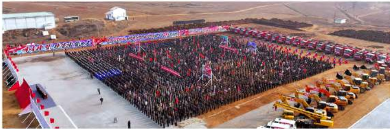
unsan Paper mill