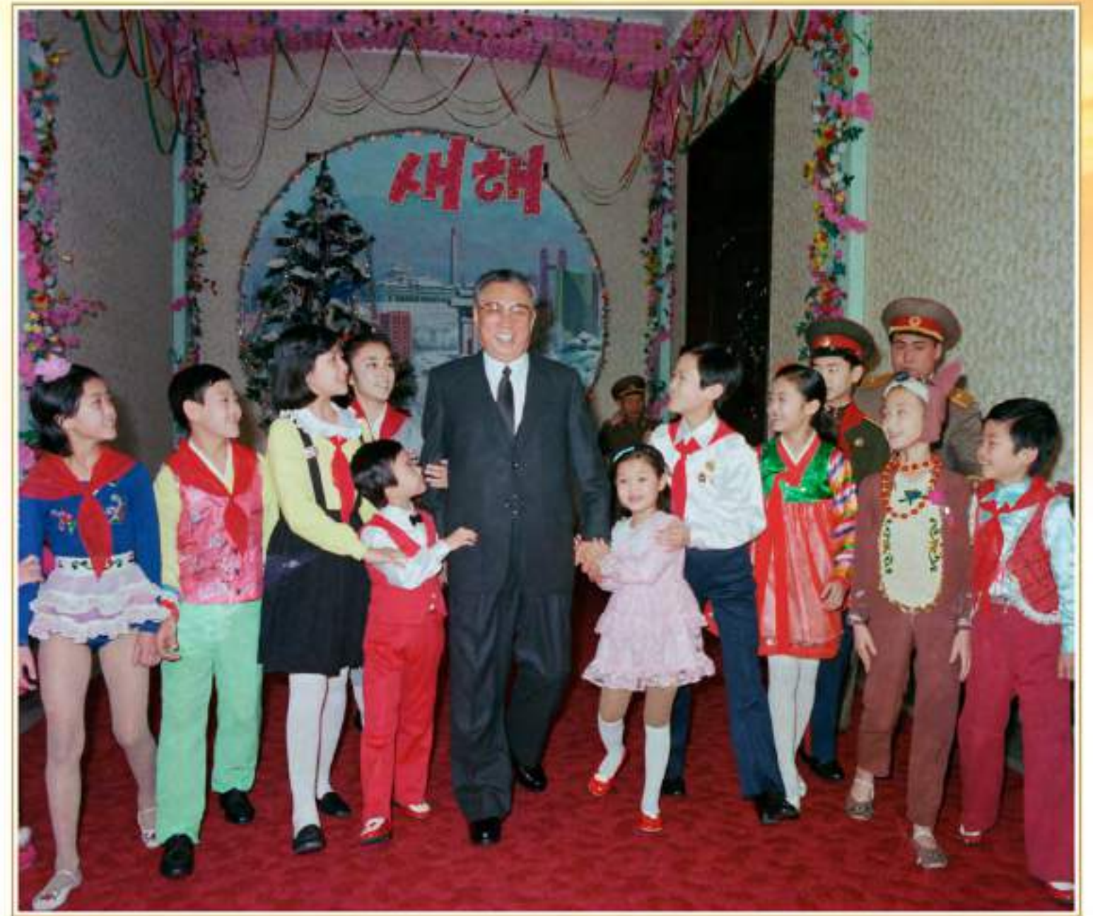
President Kim il sung attending the New Year celebration of schoolchildren in December 1986

One year, when all the children across the country were provided with new clothes and school things at state expense, the President