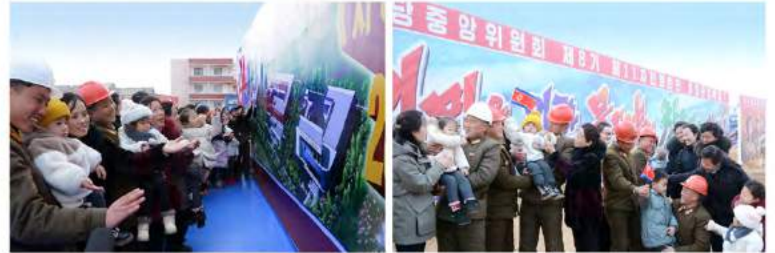
Regional-industry factories in Yomju County