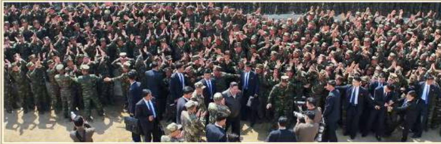
the respected comrade Kim Jong un expressed expectations and belief that all the units of the special operations forces would remain absolutely faithful to their mission of defending the country, the revolution and the people and firmly safeguard the victorious advance of the most just and sacred cause of the DPRK with matchless arms.