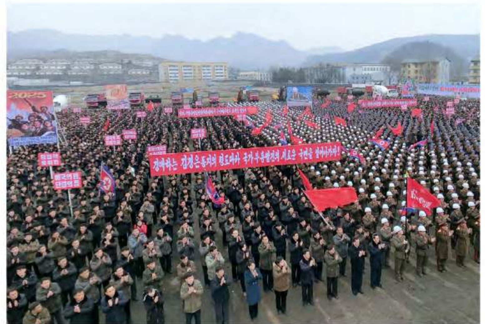
regional-industry factories in Kangdong county