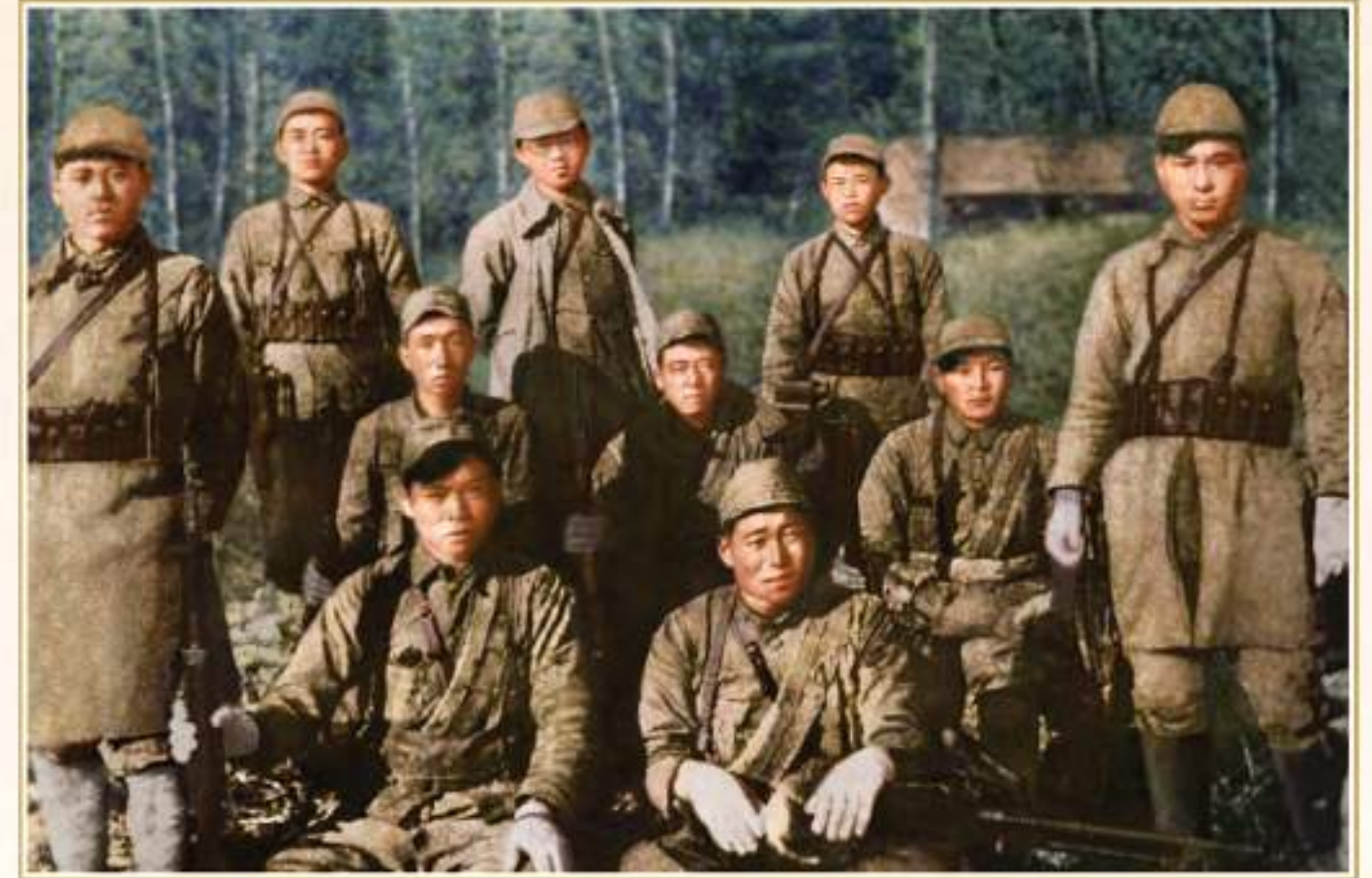
commander Kim il sung among the soldiers of the Korean People's revolutionary army (centre in the last row)