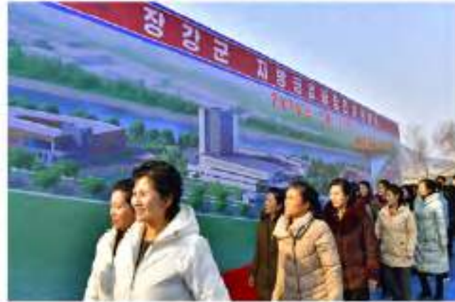
regional-industry factories in Janggang county