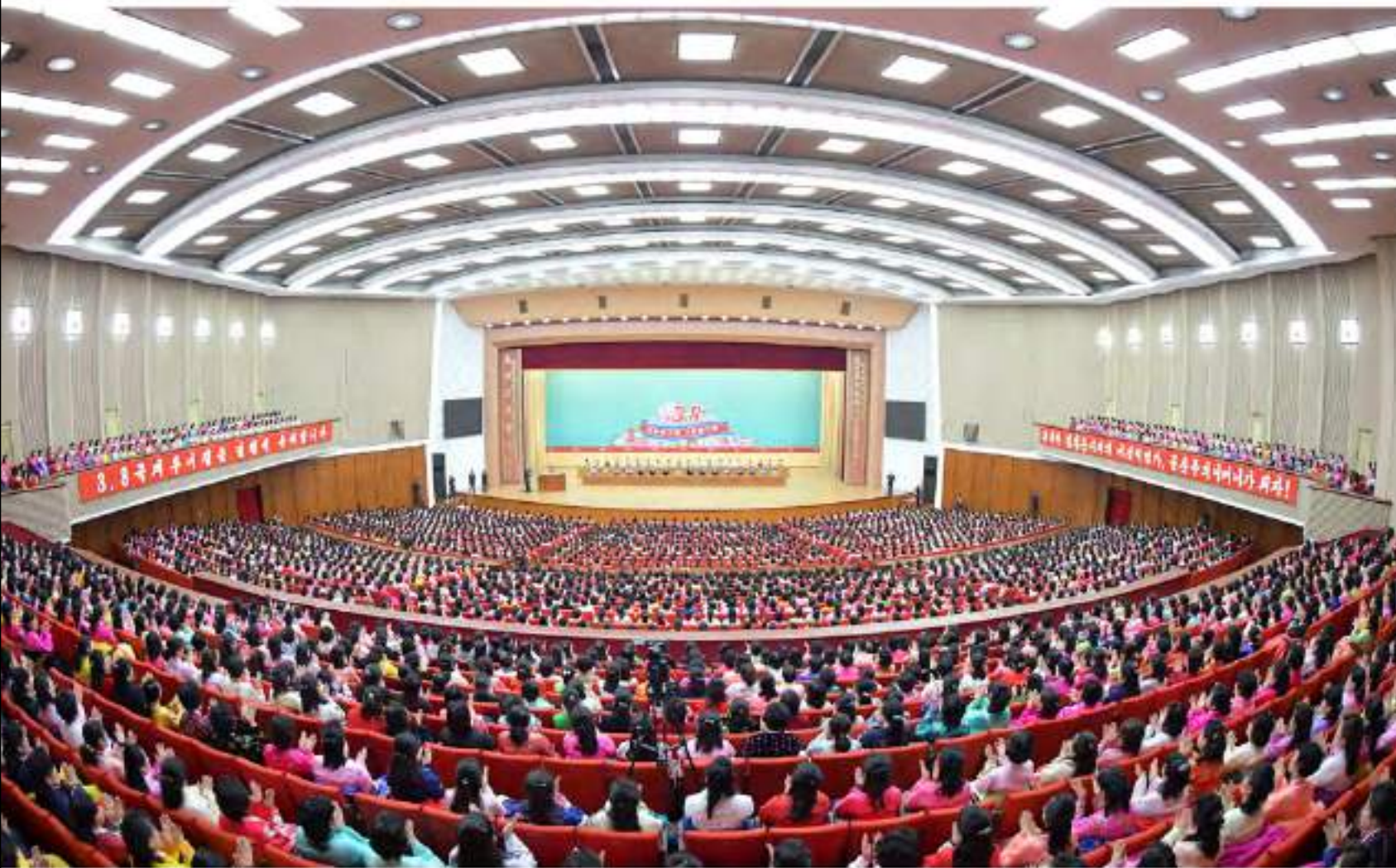
National meeting held to mark the 115 th International Women's Day

The 115 th International Women's Day was celebrated throughout the Democratic People's Republic of Korea.