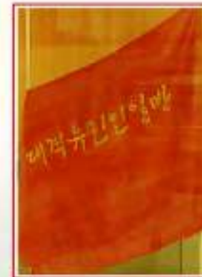
Flag of the Anti-Japanese People's Guerrilla Army used on its founding day