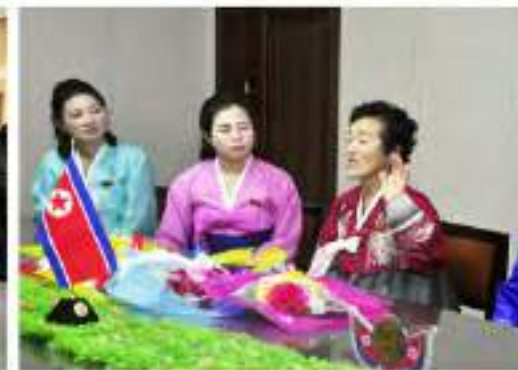
Colourful congratulatory performances and meetings were held on the occasion of the International Women's Day.

Party of Korea all the women in the country enjoy a worthwhile life as the flower of the country, life and family.