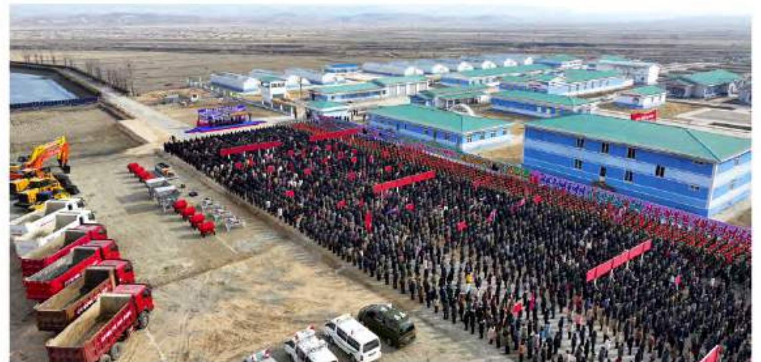
regional-industry factories in Paechon county