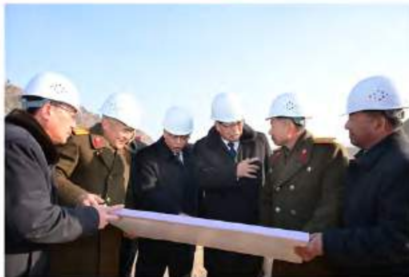
regional-industry factories in Puryong county