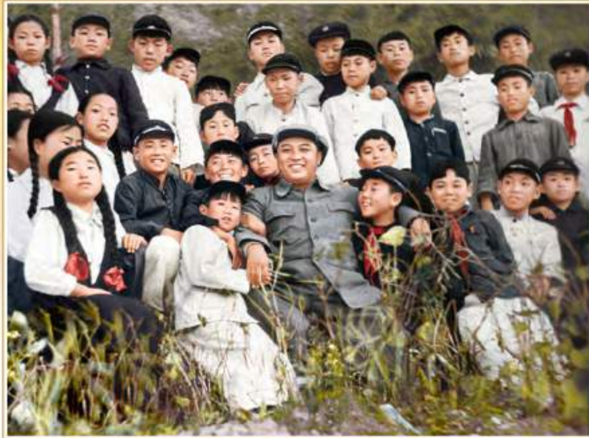
President Kim il sung among the pupils of Tongju Middle School in Pyoktong County in october 1957