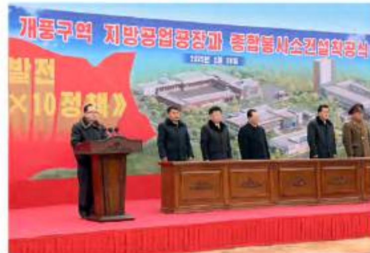
regional-industry factories and leisure complex in Kaephung District