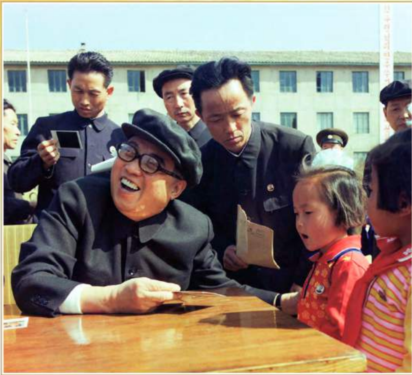
President Kim il sung after taking photos of students in new school uniforms during his visit to Yonphung senior middle school in april 1977

the President's ear, the boy's hand on the President's shoulder; and a little boy tries to climb up the bench, not knowing his shoe is slipping off. It vividly shows how much the President loved children.