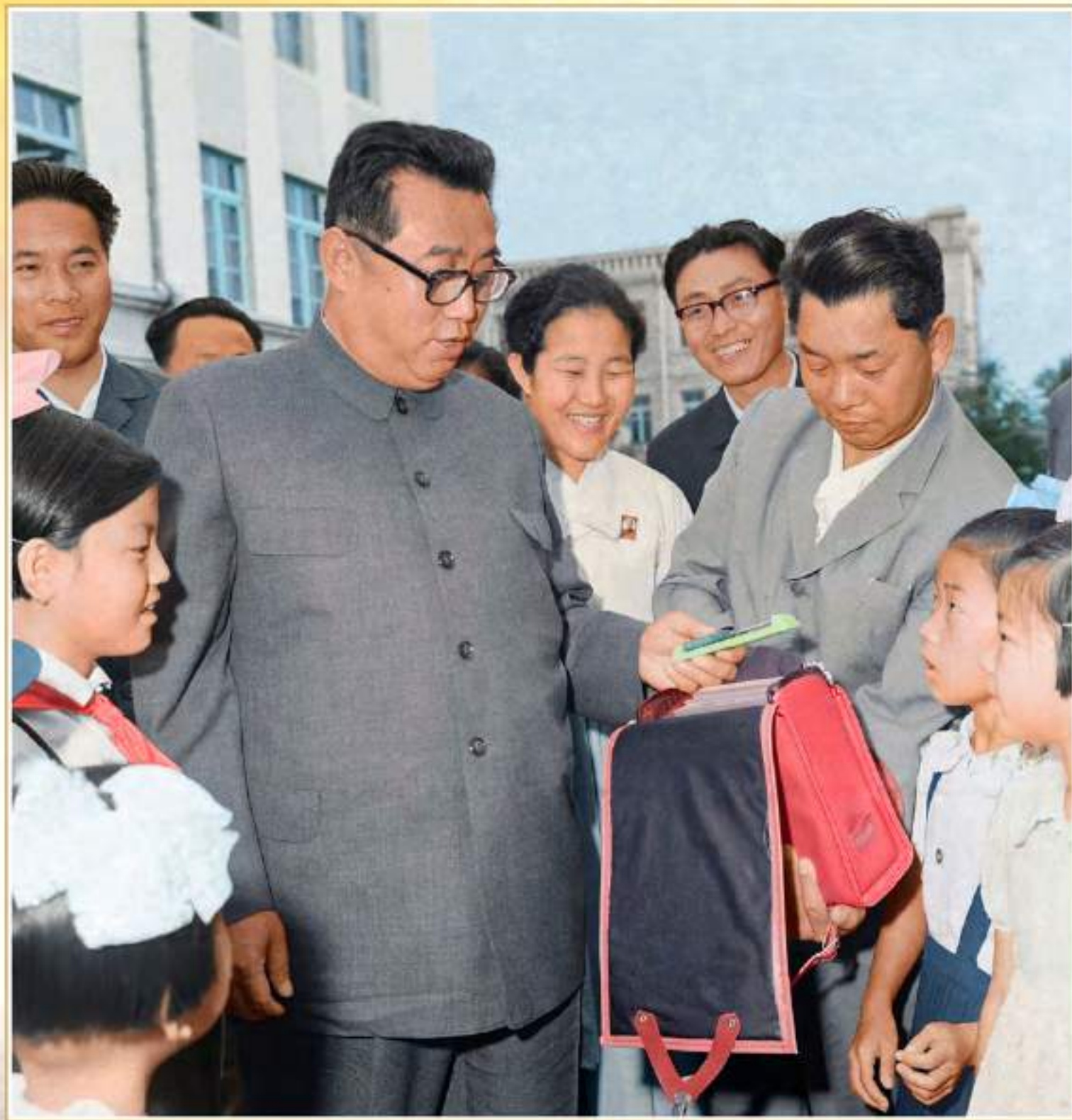
President Kim il sung, the benevolent father of all children in the country