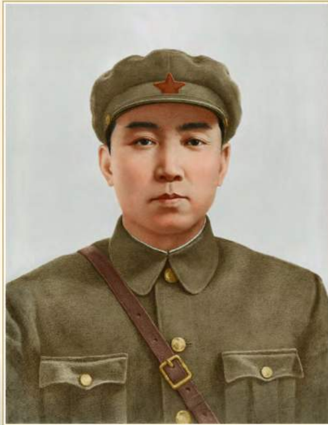
commander Kim il sung in the days of founding the anti-Japanese People's Guerrilla army