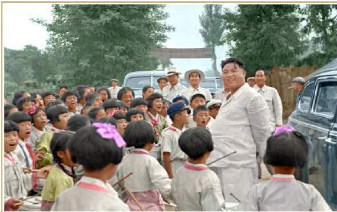
President Kim il sung among the pupils of Taepyeong Primary school in Taedong county in august 1957