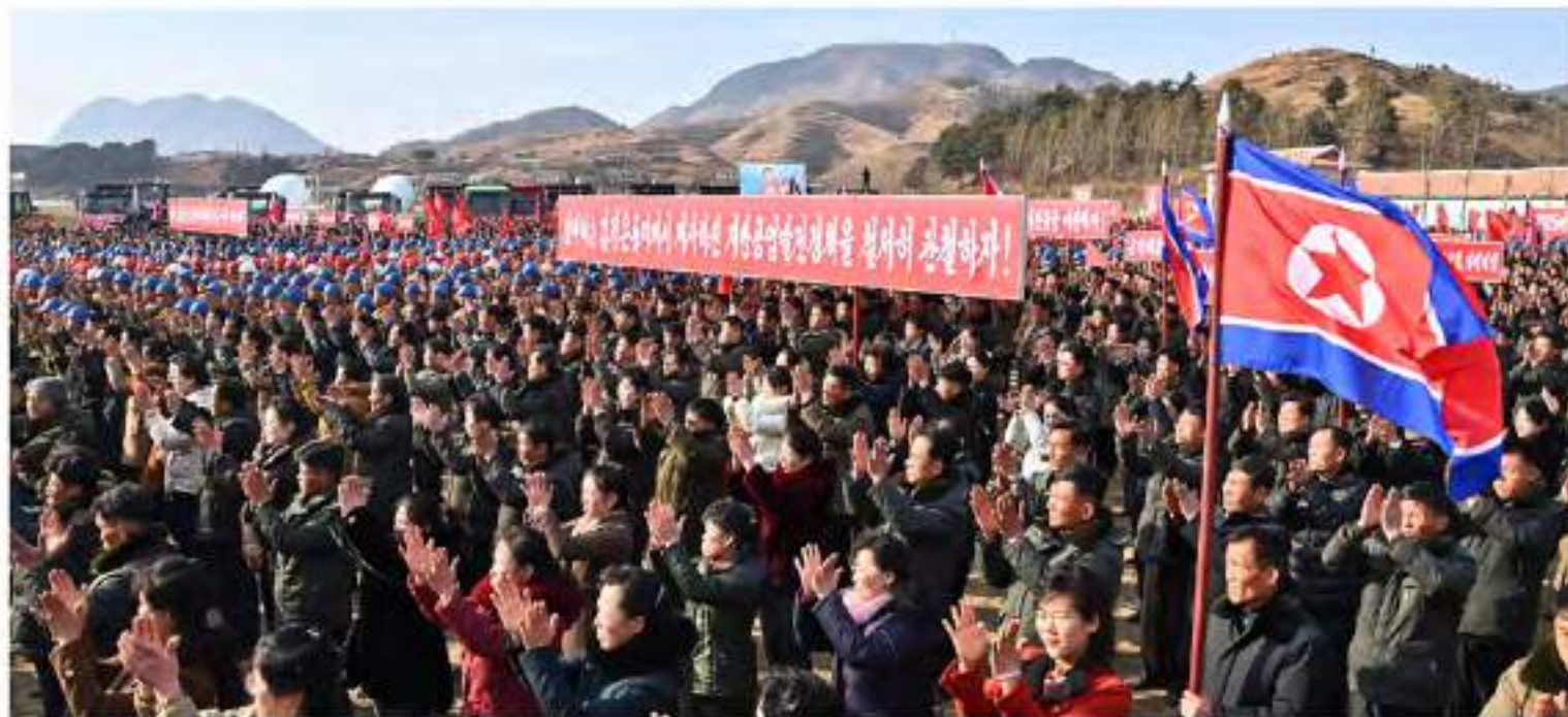
regional-industry factories in cholwon county