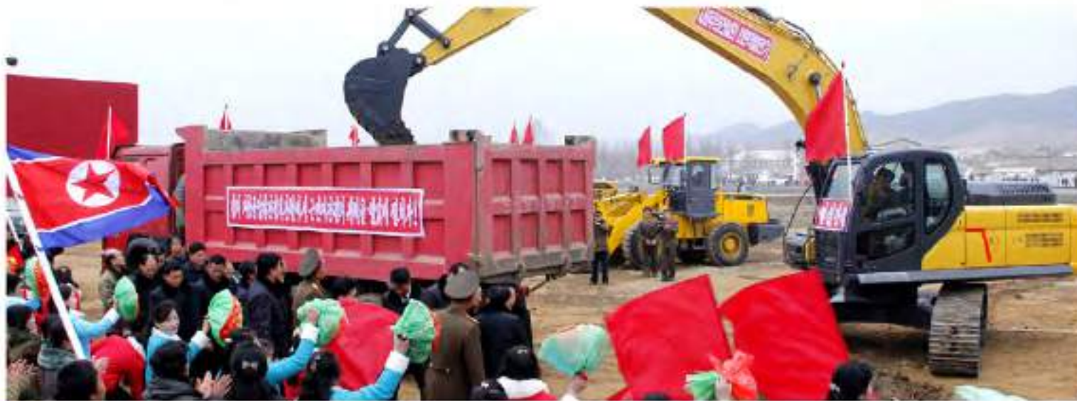
regional-industry factories in Jangyon county