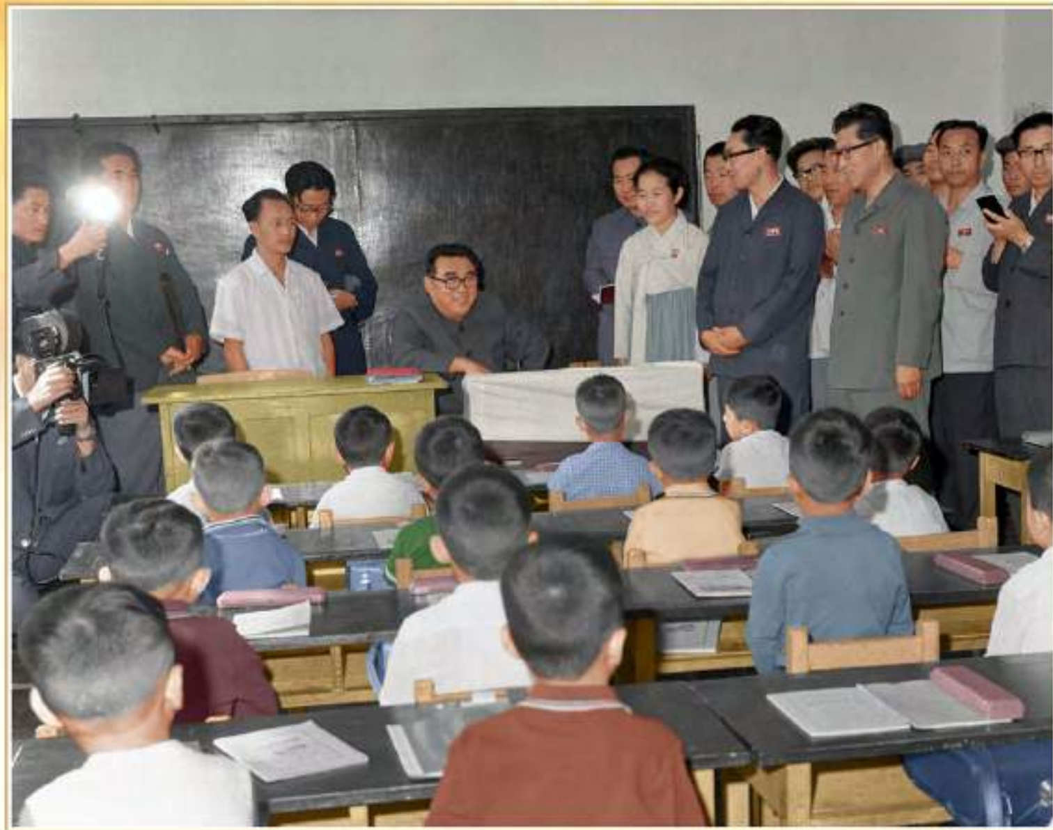
President Kim il sung on his field guidance tour of Taedongmun Primary School in Pyongyang in September 1972

President Kim Il Sung, saying that the children are the kings and queens of the country, gave top priority to the work related to the rising generation over all other affairs of the Party and state. He noted: For whom are we working? We are working for the rising generation. We should spare nothing for them. Children's palace should be built at the best place.