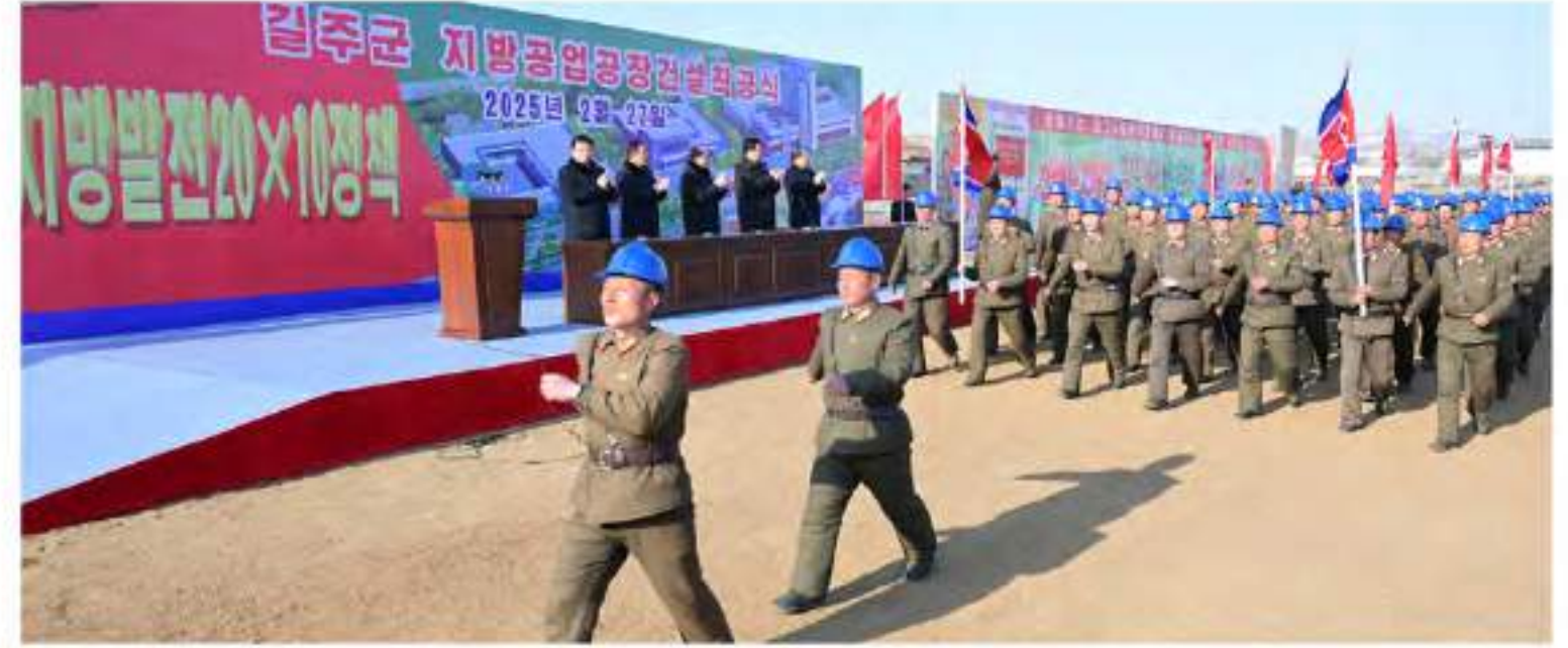
Regional-industry factories in Kilju County