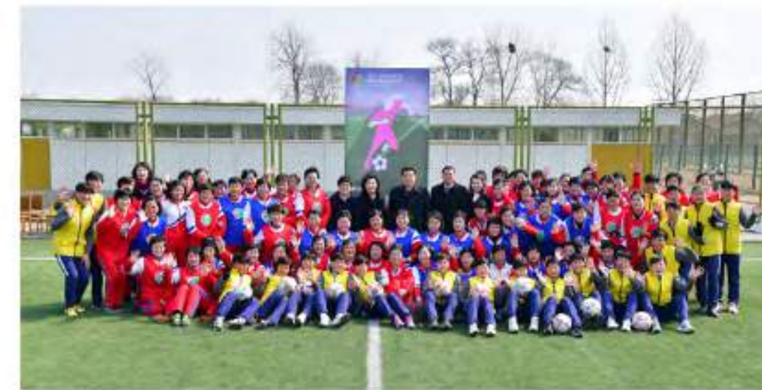
AFC Women's Football Day commemorated