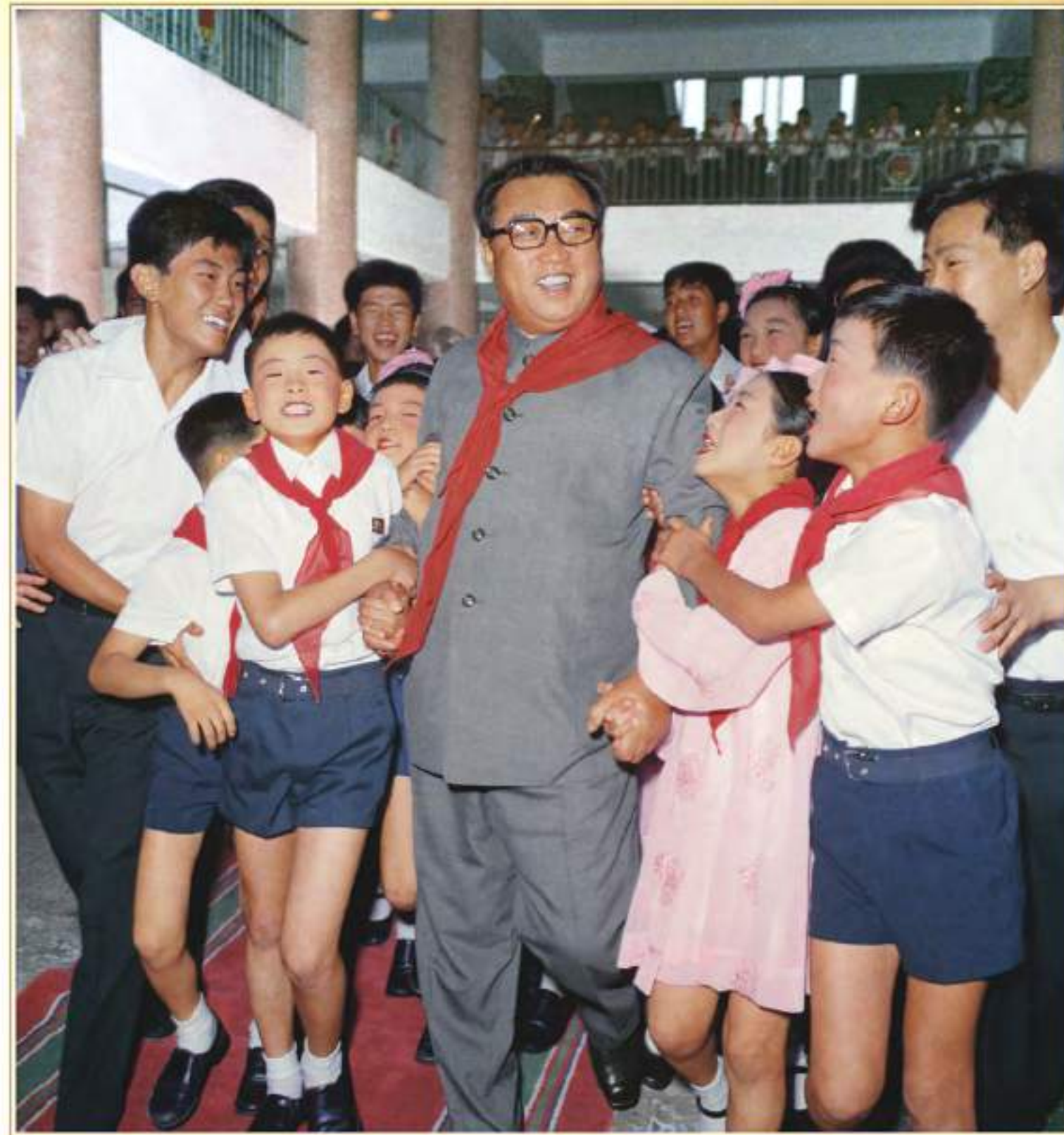
President Kim il sung together with the students and other young people on a visit to their homeland from Japan in august 1972

It portrays President Kim Il Sung on a balmy spring day, wearing a beaming smile and sitting on a bench in a park, among the children. One boy, with the President's hat on his head, rides a tricycle; another one, shouldering a wooden rifle and climbing up the bench mischievously behind the President, whispers something in